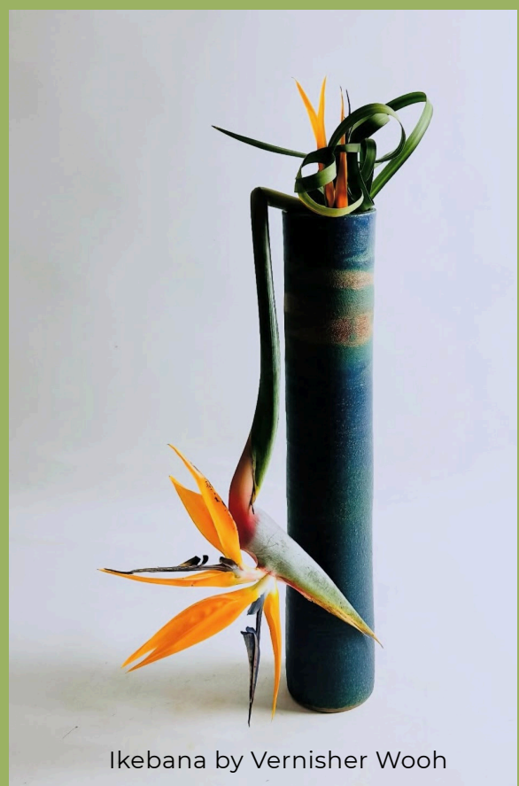
Ikebana by Vernisher Wooh

The essence of ikebana lies in the relationship between the plant material and the container. Bk 3, 10