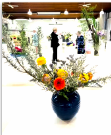
Exhibition setup in progress