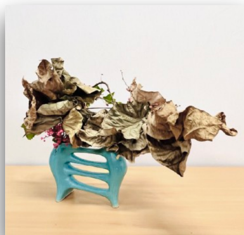
Arrangement Peggy Perkins created at the Workshop