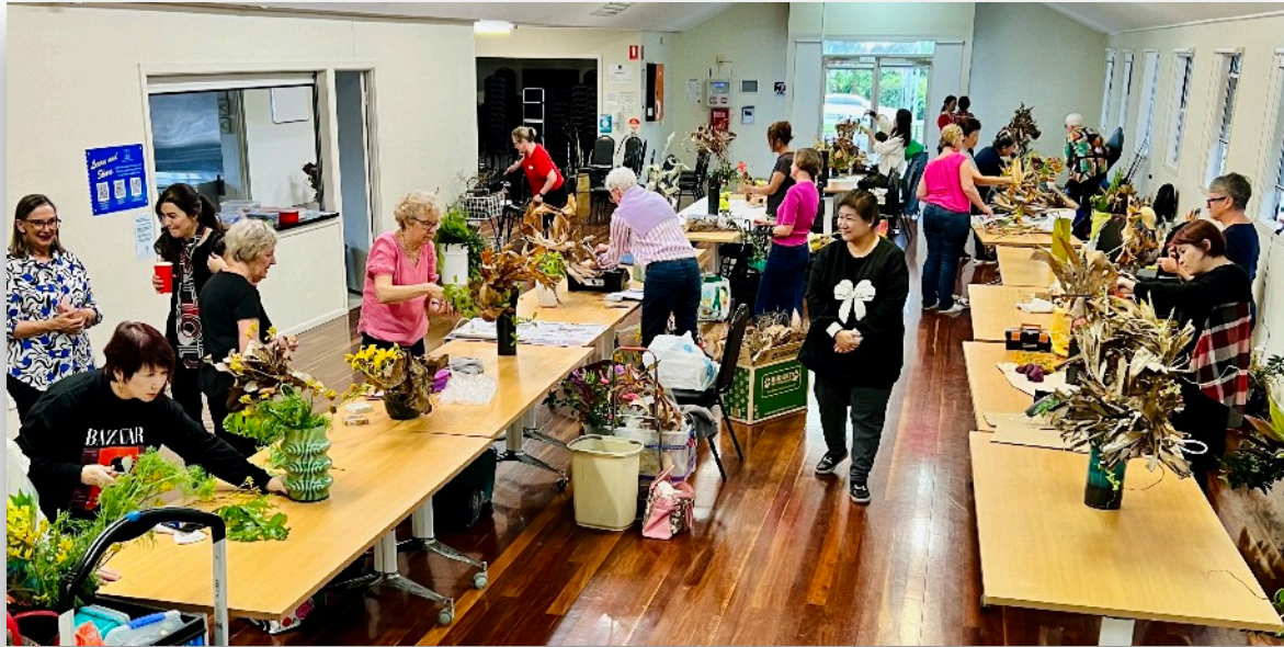
Dried leaves and fresh material transformed into ikebana masterpieces

Then it was our turn to create our own masterpiece.