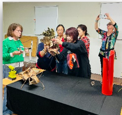
Ikebana calls for serious concentration & cooperation

Then she selected fresh tortured willow branches and split a pandana leaf. She attached her sculpture to the tortured willow and arranged all material to emphasise and create space outside the container.