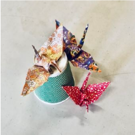
Three origami designs

Origami is an art form that can be enjoyed by old and young. It is particularly good for young children to develop finer coordination skills. To select and coordinate colours can be a very creative activity, followed by careful concentration to accurately fold a particular design.