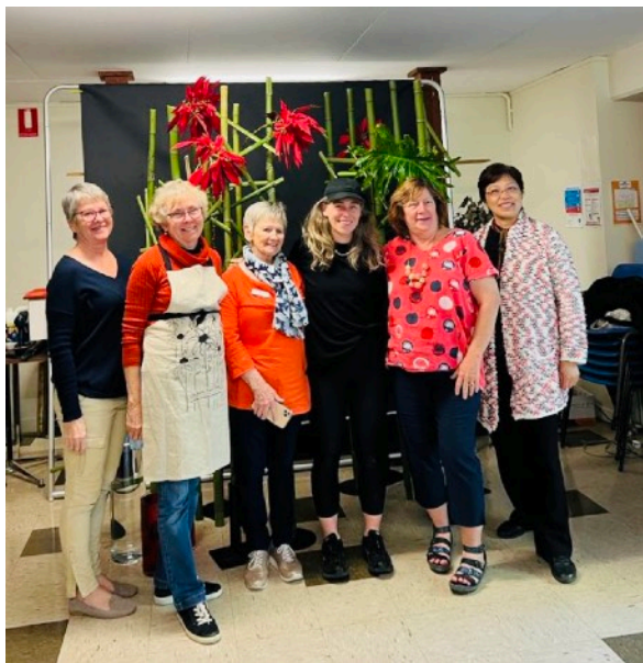
Bamboo creation in red

It was great. Lots of thinking and then pivoting but really enjoyable. Great going teams.