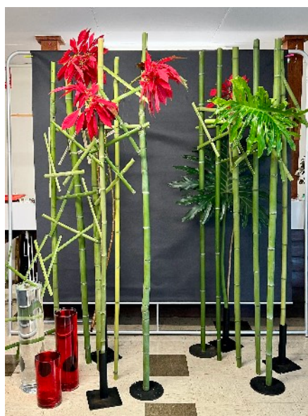
Bamboo creation by Wendy's team