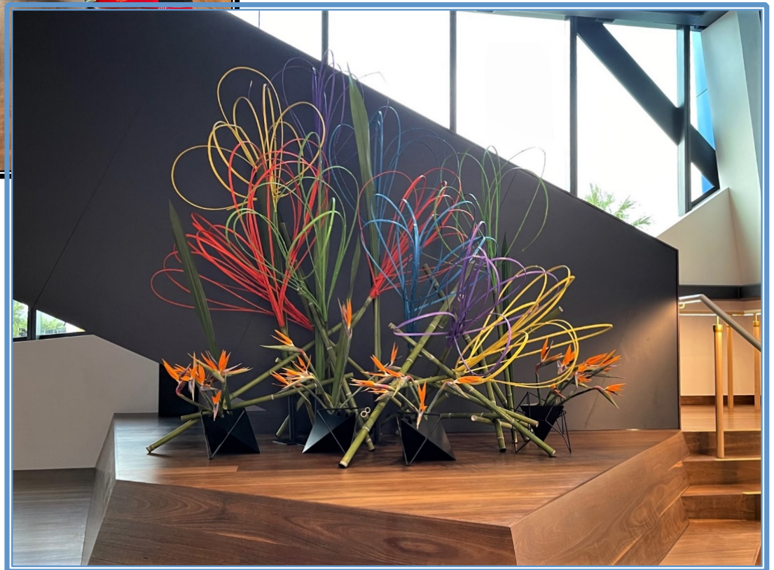
The completed arrangement

The completed arrangement was complimented with strelitzias, again reflecting the bright HOTA colours.