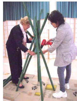
Preparing arrangements outside and inside the auditorium.