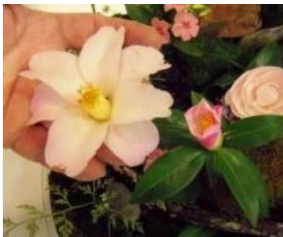
Camellia pitardii cv. 'Eiha'