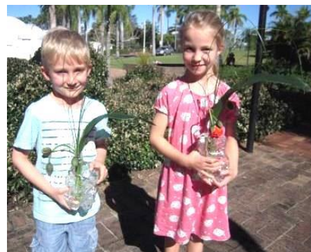
Two very proud young ikebanists after Pat's hands-on class.

I used squashed plastic drink bottles as containers and a theme of "line & surface" using steel grass, aspidistra leaves and poppies for colour. Everyone enjoyed the challenge and some shared with their friend as I had only prepared 20 bottles. Maybe we will have to make provision for more participants next year.