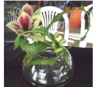
Carolyn starting with tall ceramic vase, with overflowing dried and green Japanese cycad leaves and bright Bouganvillea. Her other arrangement used an upside-down glass salad bowl with young and old crow's nest fronds and an unusual Hippeastrum.