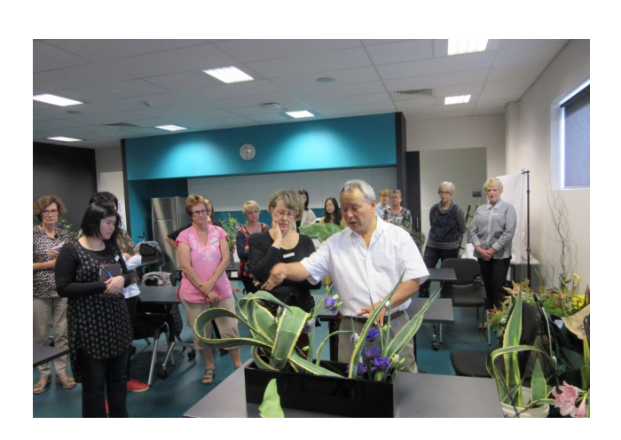
Friday—1. Composition expressing a movement

2. Composition using unconventional materials