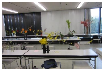
Inside the classroom

I was able to see how they fix their materials and to refine the way that I do it even further. I have conquered the downstick and the cross bars!!