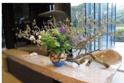
Ikebana by Ryu Ishikawa

As I walked up to the beautiful glass building I could see an exhibition of glazed ceramic containers outside and inside in the tiered exhibition area. There were also some bamboo installations. I can only imagine what it must be like when this area is filled with flowers.