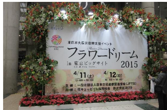
This is the sign that was outside the hall – “Flower Dream” was the name of the exhibition, which included ikebana and Western floral art as well as many other displays of flowers.