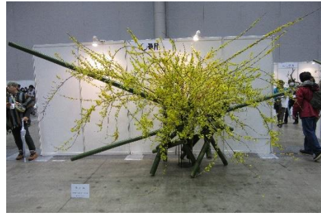
Ikebana by Misei Ishikawa and others at an Ikebana International exhibition at Tokyo Big Sight, April 2015